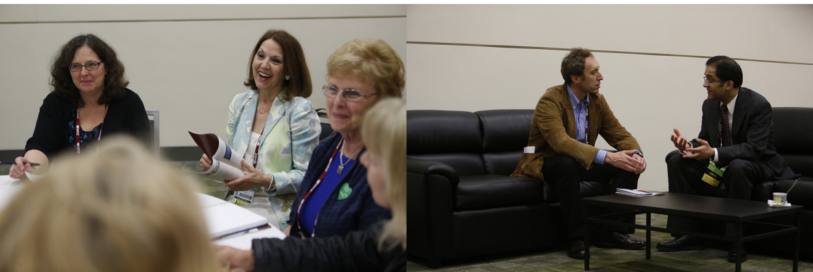
IBHRE CCDS/CEPS Lounge at Heart Rhythm 2014 in San Francisco, California