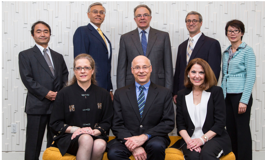
IBHRE Board Members